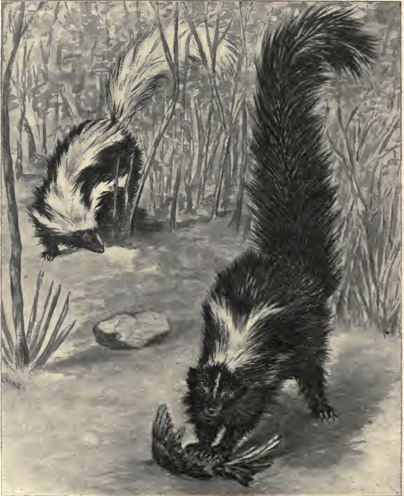
FIG. LV. MEPHITIS MACRURA. HOODED SKUNK.